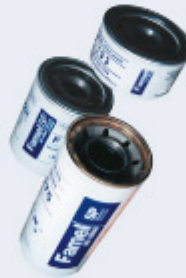
FILTROS DE ACEITE