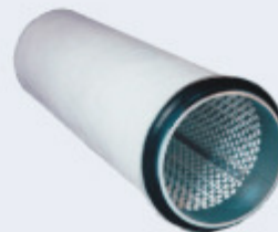
FILTROS DE PAÑO Separadores Aire Aceite