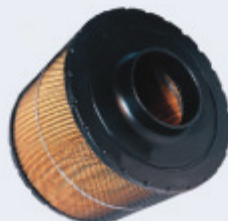
CARCAZAS FILTRANTES DE AIRE