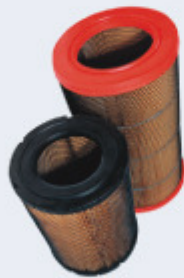
FILTROS DE AIRE SELLADO RADIAL