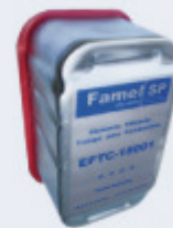
FILTROS DE COMBUSTIBLE